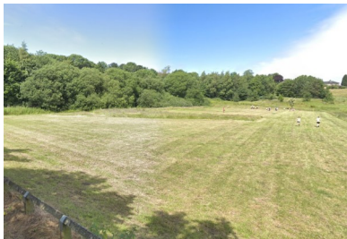
Talking About and Haworth Central Park Bowls Club.