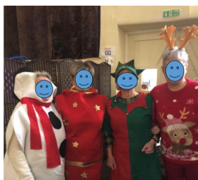
Volunteers at The New Keith Thompson Centre's Residents' Christmas Dinner.